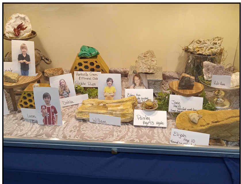
Display by Huntsville PEBBLE PUPS group at Huntsville Gem and Mineral Show