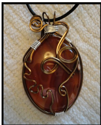
Examples of Wire Wrap and Wire Weave

Maximum 6 seats per class. Please confirm with Yvonne by TEXT at 205-602-8280