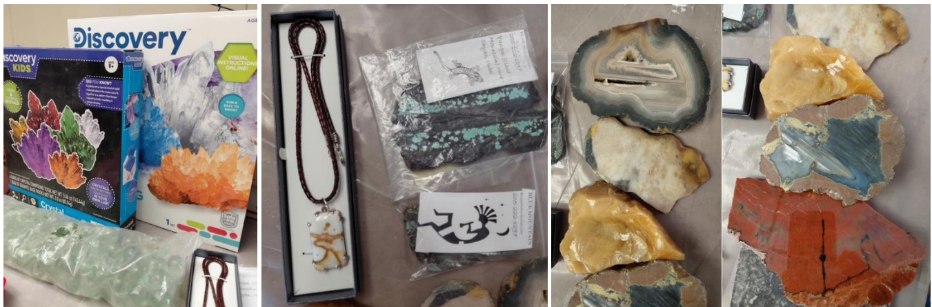
A sneak peek at more of the items that will hit the auction block this coming Friday.