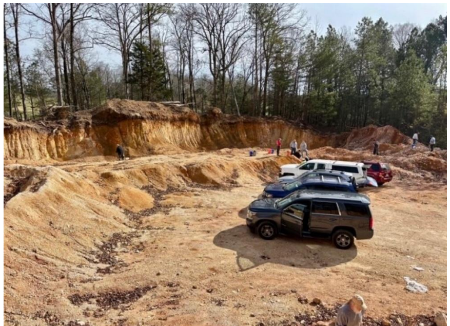
Top: AMLS digs a private pit of Pamela Patty. Summerville, GA