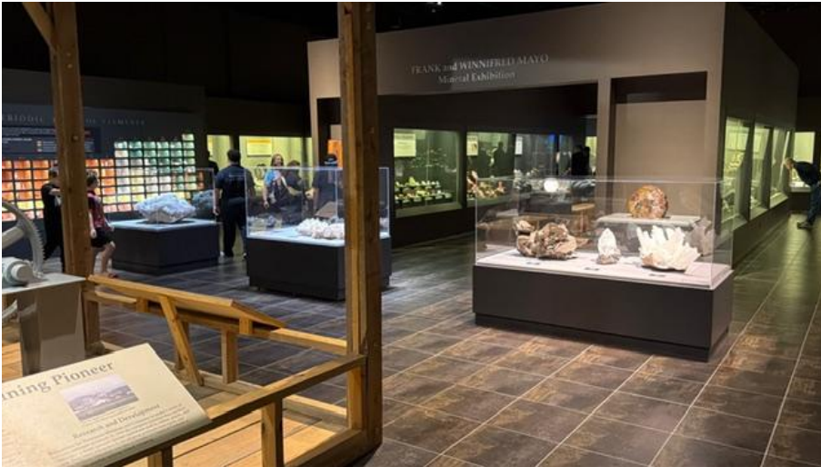
A small portion of the extensive rock, mineral, gem, and fossil collection at the Tellus Museum