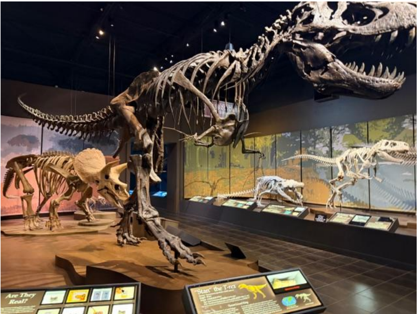
T-rex "Stan", Triceratops, Deinosuchus (giant crocodilian), and Allosaurus dominate the prehistoric skeletal collection of the Tellus Science Museum.