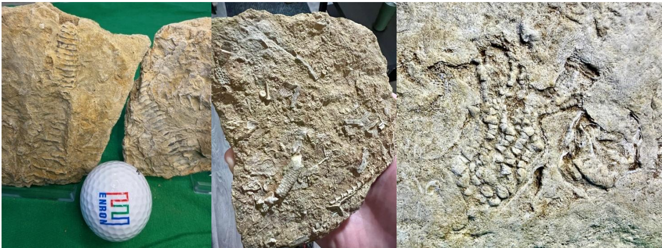
Nautiloids, Cedar Creek

First, a DMC Field Trip hosted by our club had 35 participants from GA, TN, and FL joining several of our members at the Cedar Creek Reservoir in NW Alabama on a surprisingly warm and beautiful day. Lots of Mississippian Marine Fossils including crinoids, many varieties of bryozoans and corals, nautiloids, brachiopods, ammonites, blastoids, trace fossils, and others were collected.