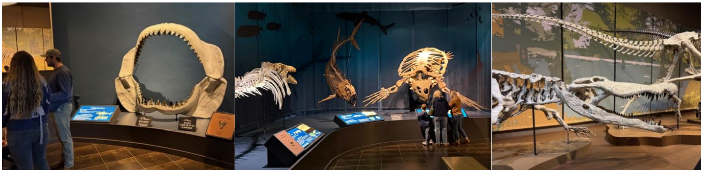
Megalodon jaw, Tellus Museum