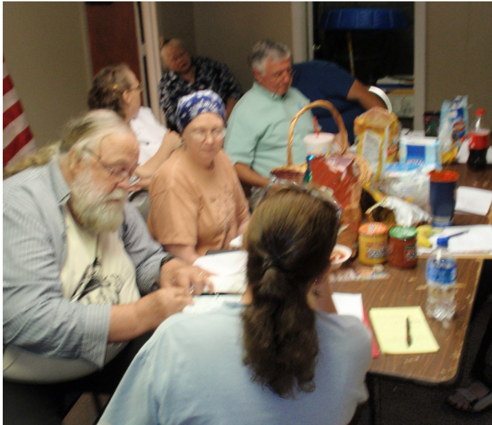
Some members of the board having a discussion concerning what we need to do next at the workshop. Move in the equipment, getting it going, and cut rocks, of course!