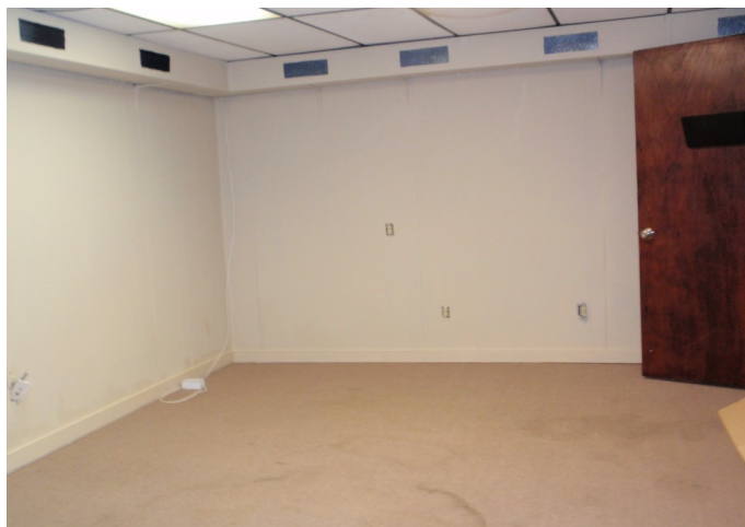
YOU SHOULD JUST SEE IT NOW ! We have some equipment instead of an empty room!